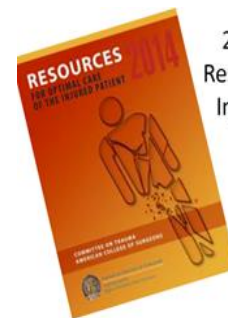
2014 Optimal Resources for the Injured Patient